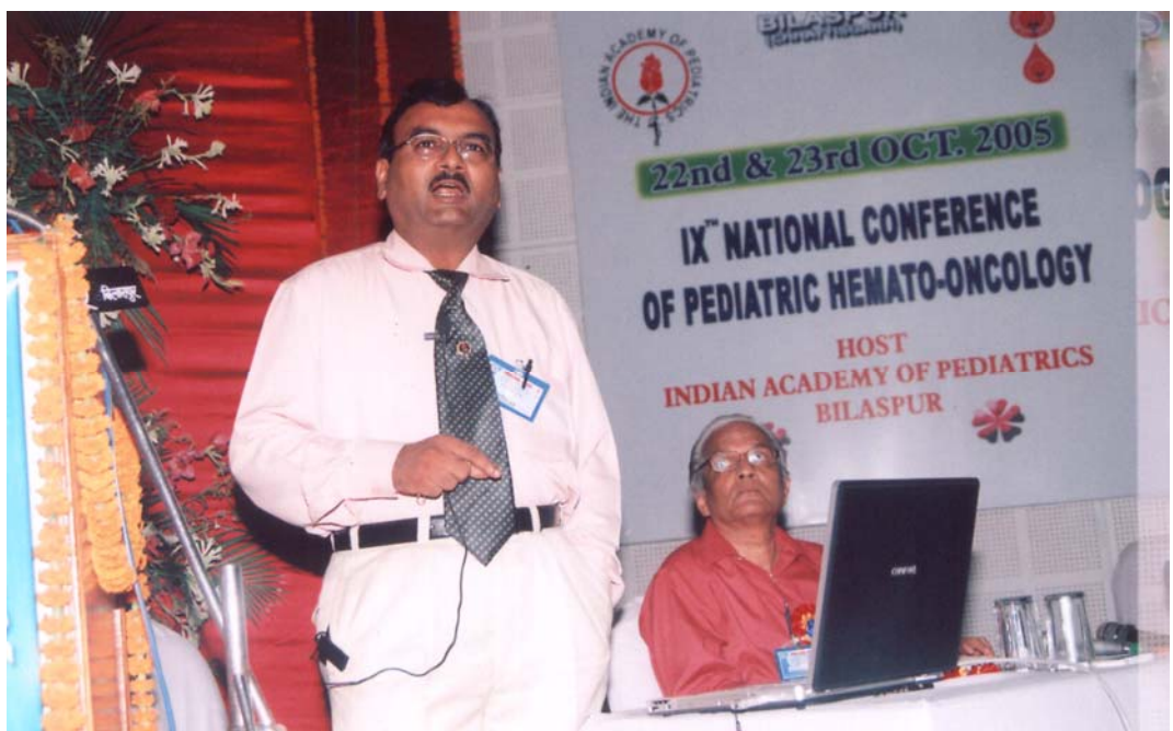
PHOCON 2005 in progress – Bilaspur, Chattisgarh