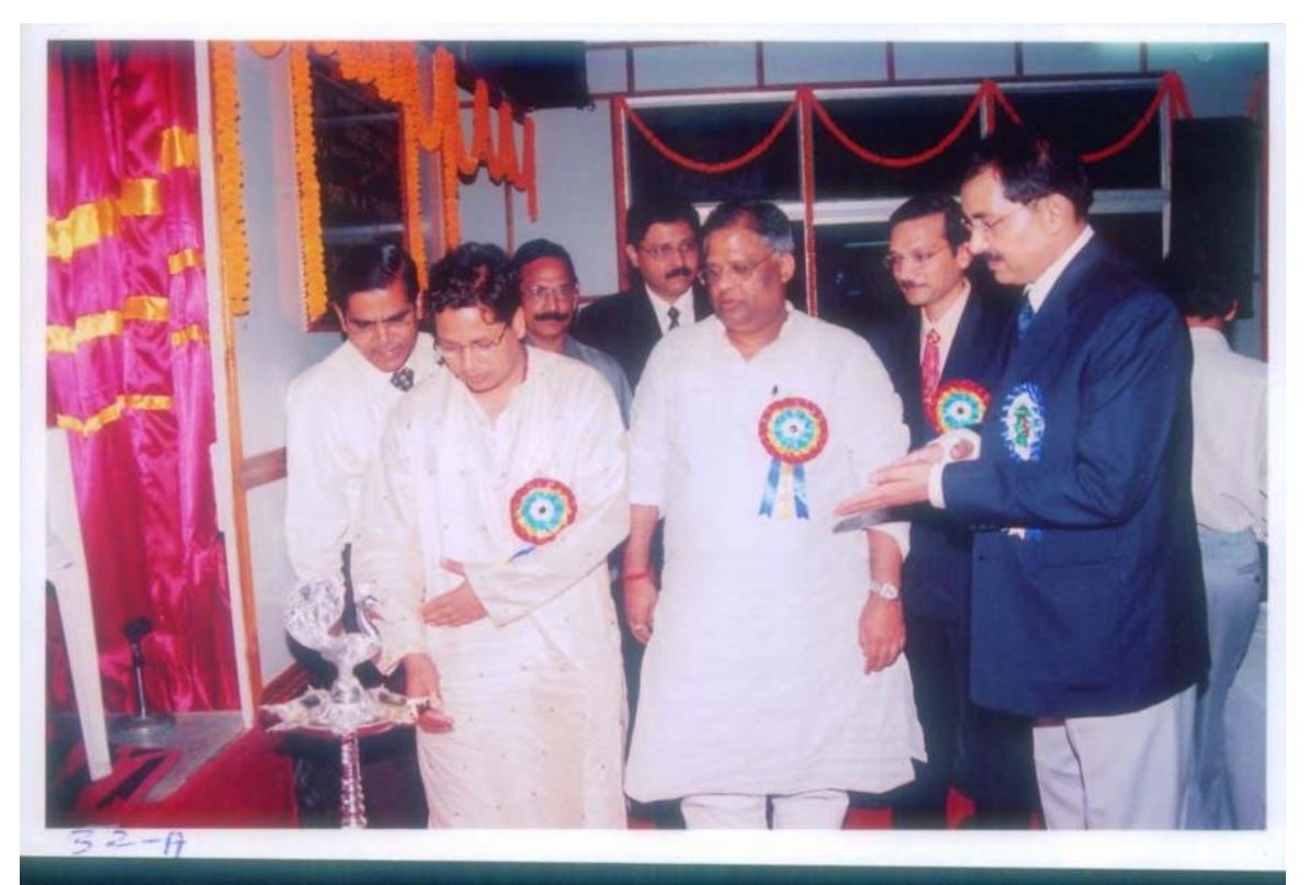
Ministers of the Govt of Chattisgarh lighting the lamp