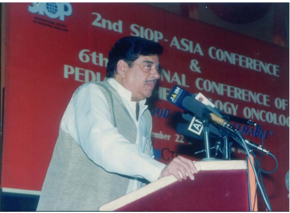
Sh Shatrughan 'shotgun' Sinha, Union health minister, Govt. of India delivering the keynote address