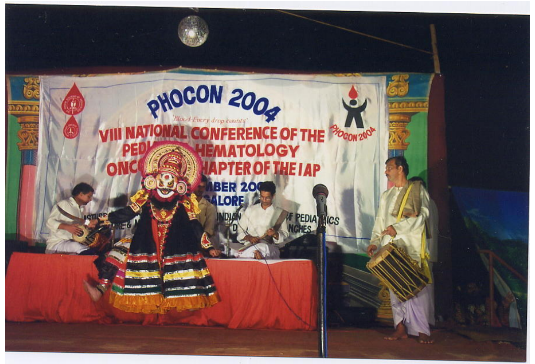
Yakshagana! The cultural programme in full swing. Mangalore 2004