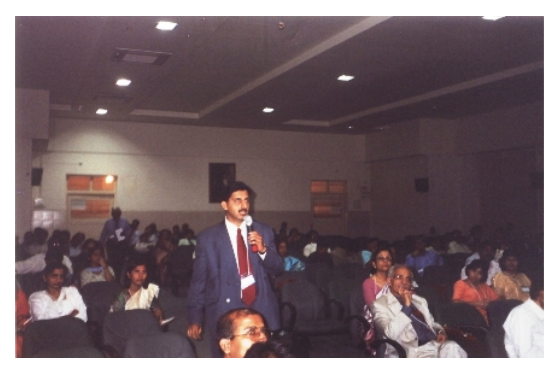
Audience Paticipation at PHOCON 2003, Pune