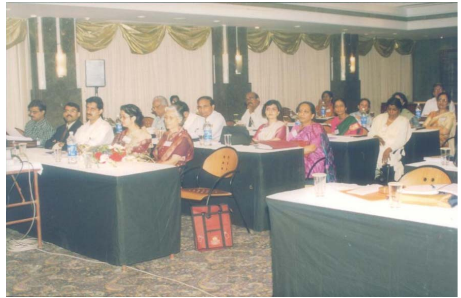
Distinguished delegates in rapt attention