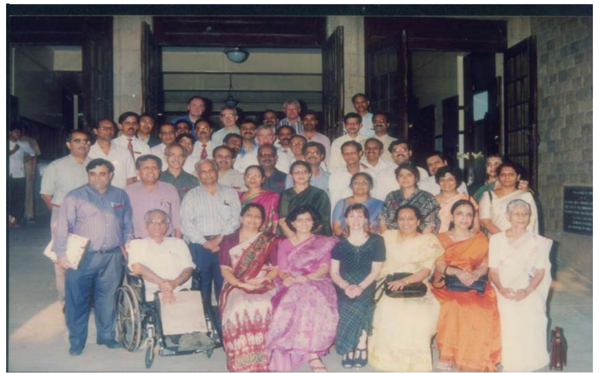
Thank God it's over! Portrait at the end of the meeting