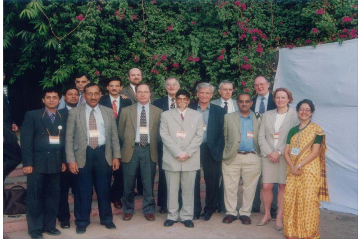
Faculty from far and near