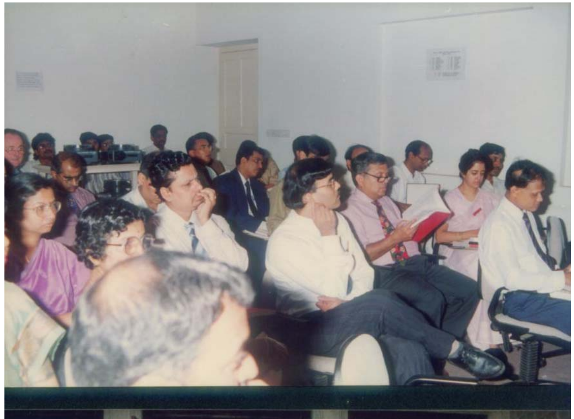
Attending delegates in a pensive mood.