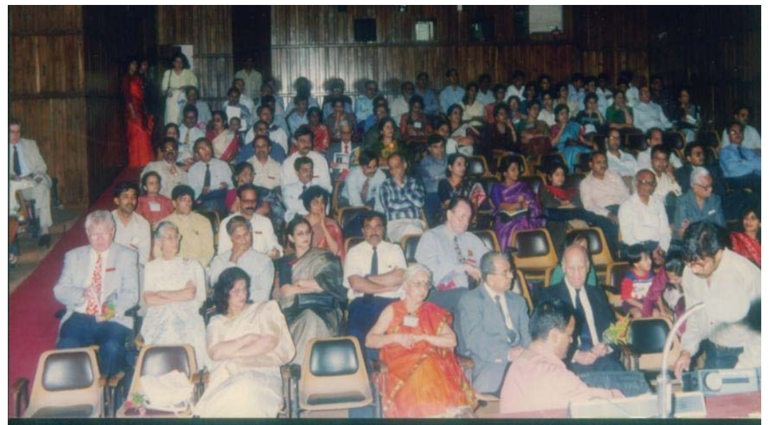
Ist PHOCON - 1997: a view of the delegates